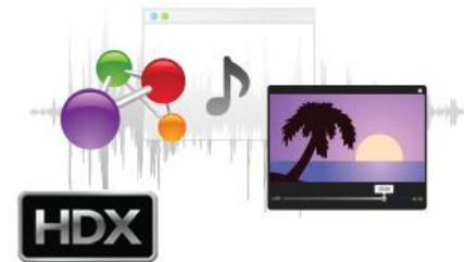
Delivered with HDX technology