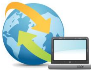
Access from anywhere