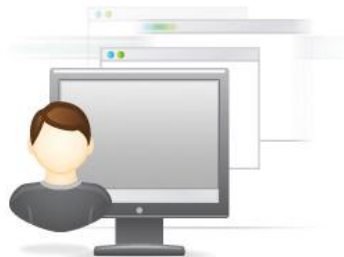
Dynamic desktop assembly